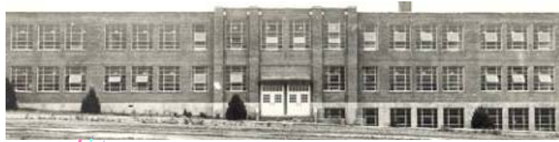
Luther H. Foster High School